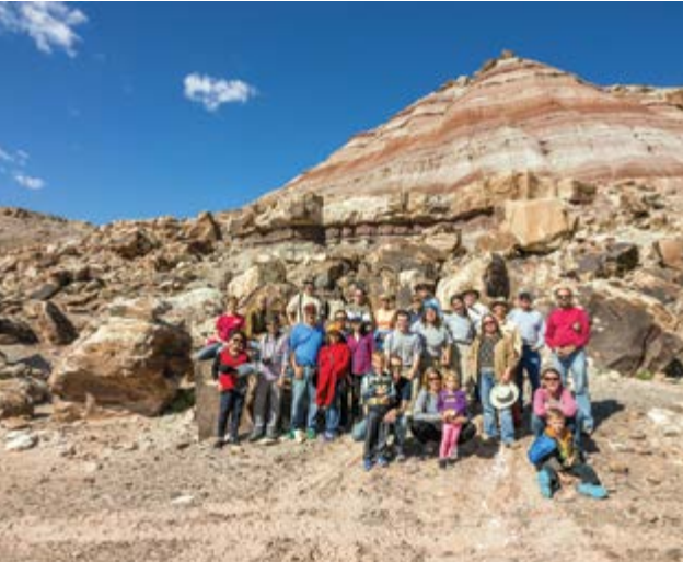
Field trip group at Fossil Point, south of Green River, Utah.

Green River Rocks is brought to you by Epicenter, a 501(c)3 non-profit organization that was established in 2009. Epicenter stewards creative initiatives that combine art, architecture, and rural investment in order to build a more resilient, equitable, and vibrant local community. Visit rurallandproud.org for more info.