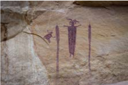
Green River Rocks Festival.