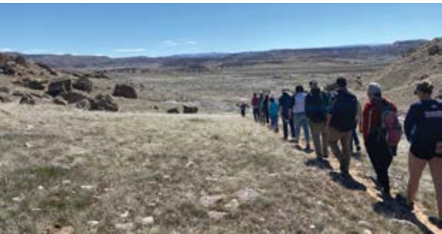
Green River Rocks Festival.

Green River Rocks is brought to you by Epicenter, a 501(c)3 non-profit organization that was established in 2009. Epicenter stewards creative initiatives that combine art, architecture, and rural investment in order to build a more resilient, equitable, and vibrant local community. Visit rurallandproud.org for more info.