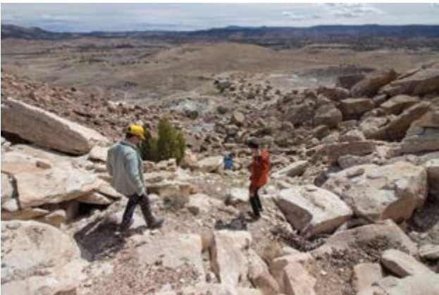
Field trip to Jurassic National Monument, Emery County, Utah.